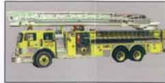
Late 1900's Diesel Powered Truck Average response time 8-12 minutes.