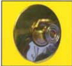
Gem Brass Sidewall