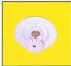
Glass Bulb Pendant