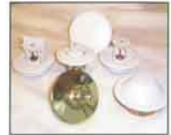
21st Century State of the Art Sprinklers Average response time 30-60 seconds.