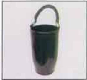
1800's Bucket Brigade Average response time 60 minutes.