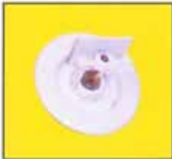
Glass Bulb Sidewall